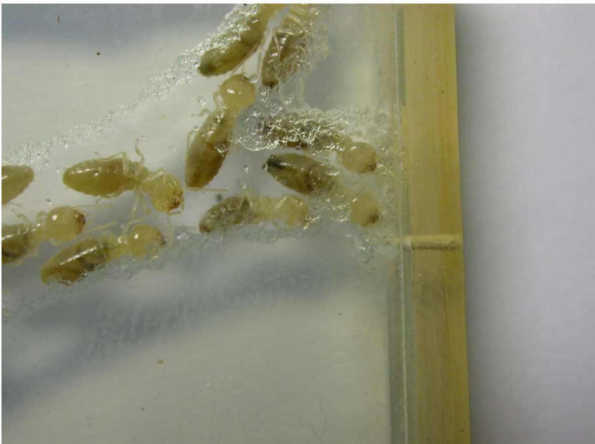
Figure 2 Experimental apparatus to study termite attack on a synthetic barrier material

The large body of work describing biologically active repellent or attractive plant volatiles is in stark contrast to research investigating physical defences of plants (Sanson et al., 2001). What physical characteristics make a material difficult for termites to attack remains largely unanswered. Studies addressing the issue typically investigate the quality of hardness or general material type. It has been suggested that termites will only damage materials less hard than mandibles of termites (Potter, 1997), yet we are unaware of any quantification of termite mandibular hardness and contributing factors. Because mandibular hardness is associated with high concentration of zinc and