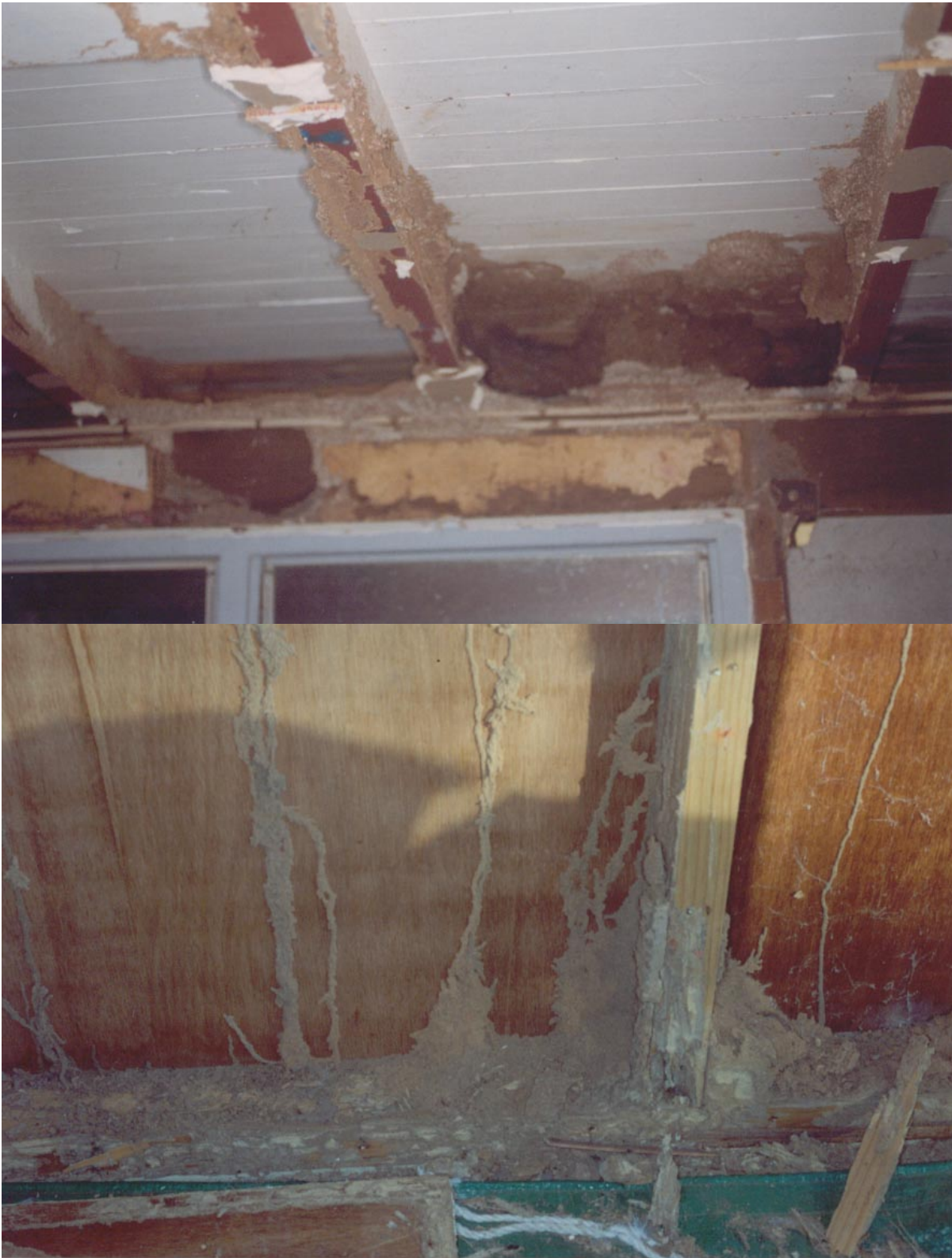
Figure 1 Examples of termite damage.